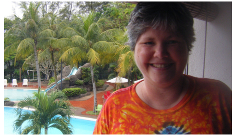
The Ole' Swimming Hole